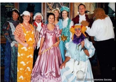
YMCA Pantomime Beauty and the Beast 2005

Following the Christmas Brunch at the Armdale Yacht Club, December 5 RSGS members are invited to attend the Theatre Arts Guild Pantomime Presentation of Beauty and the Beast at 2 pm at Frog Pond 6 Parkhill Drive Halifax.